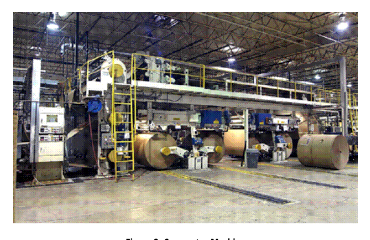
Figure 2: Corrugator Machine

Starch-handling internal gear pumps are most often not supplied with safety-relief valves. Line blockage because of the starch settling out in the discharge piping is a fairly common occurrence, and pump and mechanical seal damage can happen in the event of line blockages with no pump relief valve for overpressure protection. On the other hand, in the event of pressure spikes, the relief valve can open and not reseat, resulting in relief valve chattering, bypassing of fluid, and loss of flow.