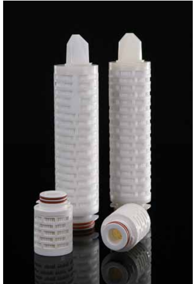
Note: TETPOR is a registered trademark of Parker domnick hunter