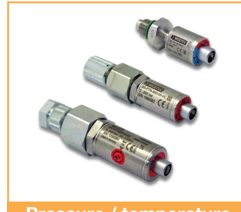
Pressure / temperature sensors