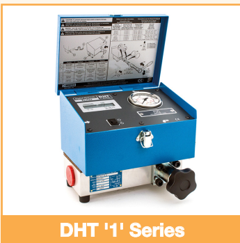
DHT '1' Series