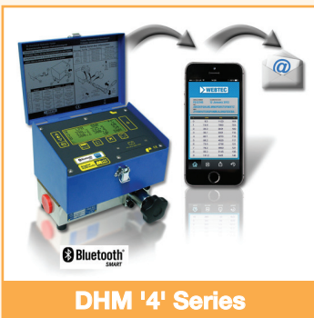
DHM '4' Series