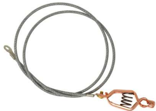
Cable, plug, and clip assembly 48" overall GTP-1094.

Overwing bonding/grounding assembly, 90" long, with clip. NFPA requirement, you must bond before removing cap on aircraft GTP-1095 (as shown).