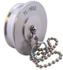
TL-1652 Dust Plug with Chain