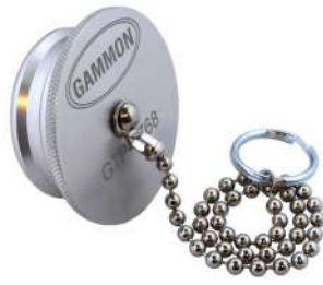
GTP-1768 Dust Plug with Chain