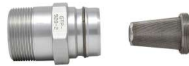
GTP-1534 24 x 110 mesh stainless steel Optional strainer for all 1½" actuators, except GTP-920-3S

For strainer and actuator assembly, order GTP-1510