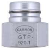
Female GTP-920-1 1½" NPT GTP-920-4 1½" BSP