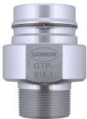
GTP-918-1 1½" NPT GTP-918-3 1½" BSP