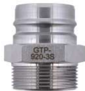
Male GTP-920-3S 1½" BSP Stainless Steel