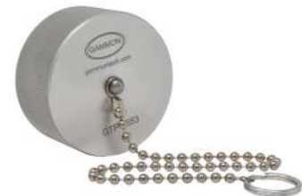
GTP-1653 Dust Cap with Chain