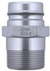
Male GTP-920-2 1½" NPT GTP-920-3 1½" BSP