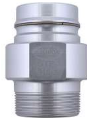
GTP-918-2 2" NPT GTP-918-4 2" BSP