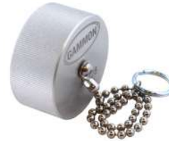
GTP-1428 Dust Cap with Chain