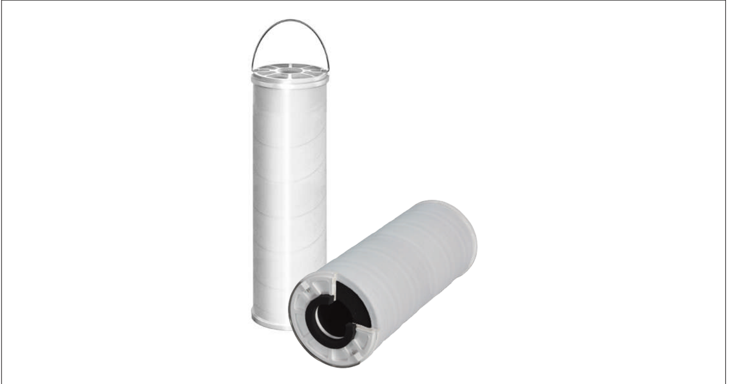
XTREAMSORB® PEACH® CARBON BLOCK FILTER-ADSORBER CARTRIDGES

Note: The following information is provided as a minimum guideline. Due to the variety of models that can be used in Vessel, it is strongly suggested to refer to the specific cartridge data sheet for further detailed pressure information. To prevent damage, never exceed the maximum allowable differential pressure of the cartridge support plate in the Vessel.