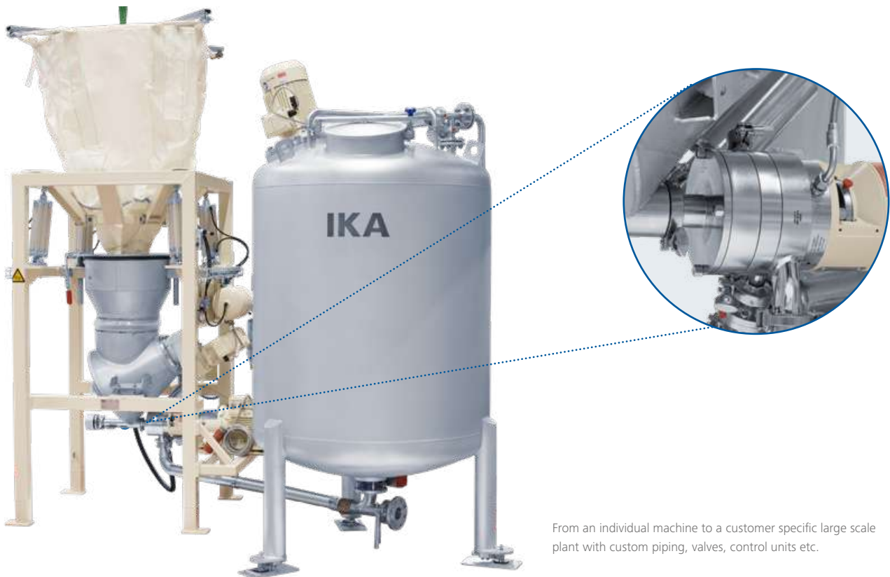
From an individual machine to a customer specific large scale plant with custom piping, valves, control units etc.

The CMX can be flexibly adjusted to the most varied installation and process requirements. For instance, a wide range of tools, both vertical and horizontal installation, and process connections to match the standard connections on the customer side are all possible. From a standard individual machine to a customer-specific plant with peripheral devices such as a solid feeding system or mixing vessels – IKA process technology can fulfill all customer requirements.