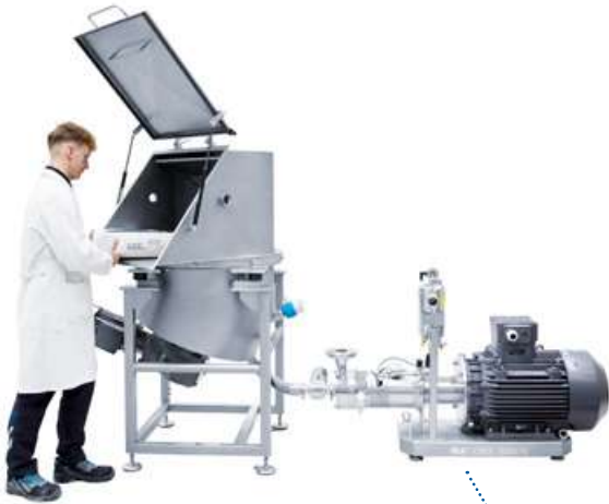
Enclosed sack emptying station with integrated fluidizer for dusty powders