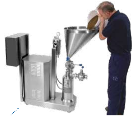
Manual feeding using a funnel