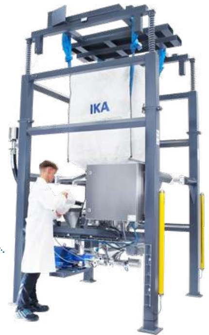
CMX 2000/05 integrated into a Big Bag station