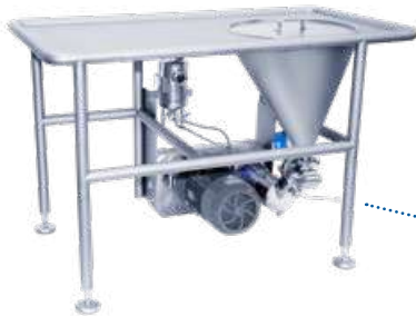
Table frame as a feeding aid for non-dusty powders or fine granulates

Solid infeed: Depending on the production scale and the vessel for the solids, the solid material can be fed into the CMX by means of a Big Bag station, sack emptying station, a loading table, directly via a funnel, or manually using a suction lance (straight from from the bag).