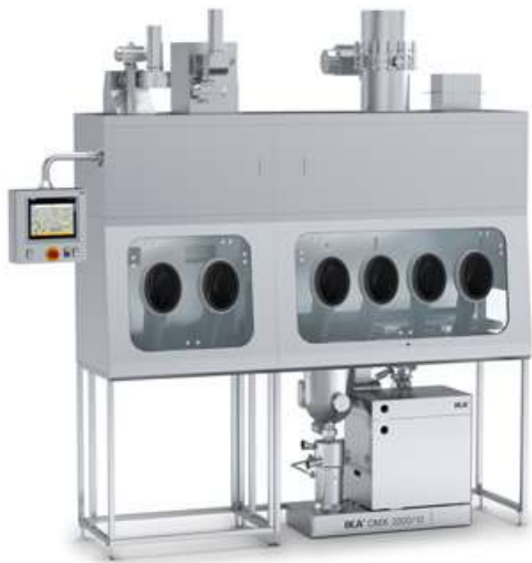
CMX 2000/05 integrated into a glove box

The CMX is ideally suited for the manufacture of the most varied pharmaceutical products. GMP-compliant, enclosed designed, also integrated into a glove box – all this is possible thanks to our decades of experience within the pharmaceuticals industry.