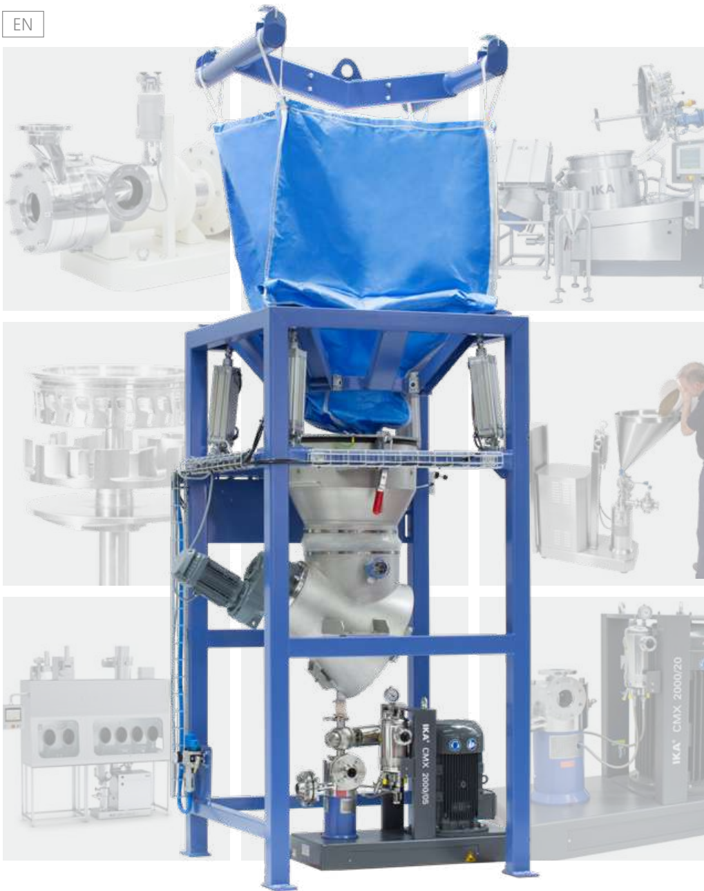
CMX - UNIVERSAL SOLID-LIQUID MIXING SYSTEM INLINE MULTI-LEVEL FEEDING & DISPERSING