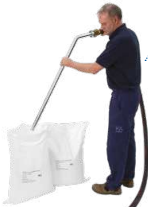
Manual feeding using a suction lance

Solid infeed: Depending on the production scale and the vessel for the solids, the solid material can be fed into the CMX by means of a Big Bag station, sack emptying station, a loading table, directly via a funnel, or manually using a suction lance (straight from from the bag).