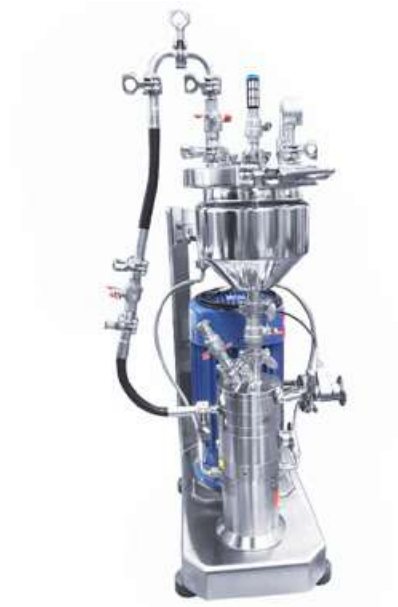
CMX 2000/04 with enclosed powder funnel for rinsing and cleaning